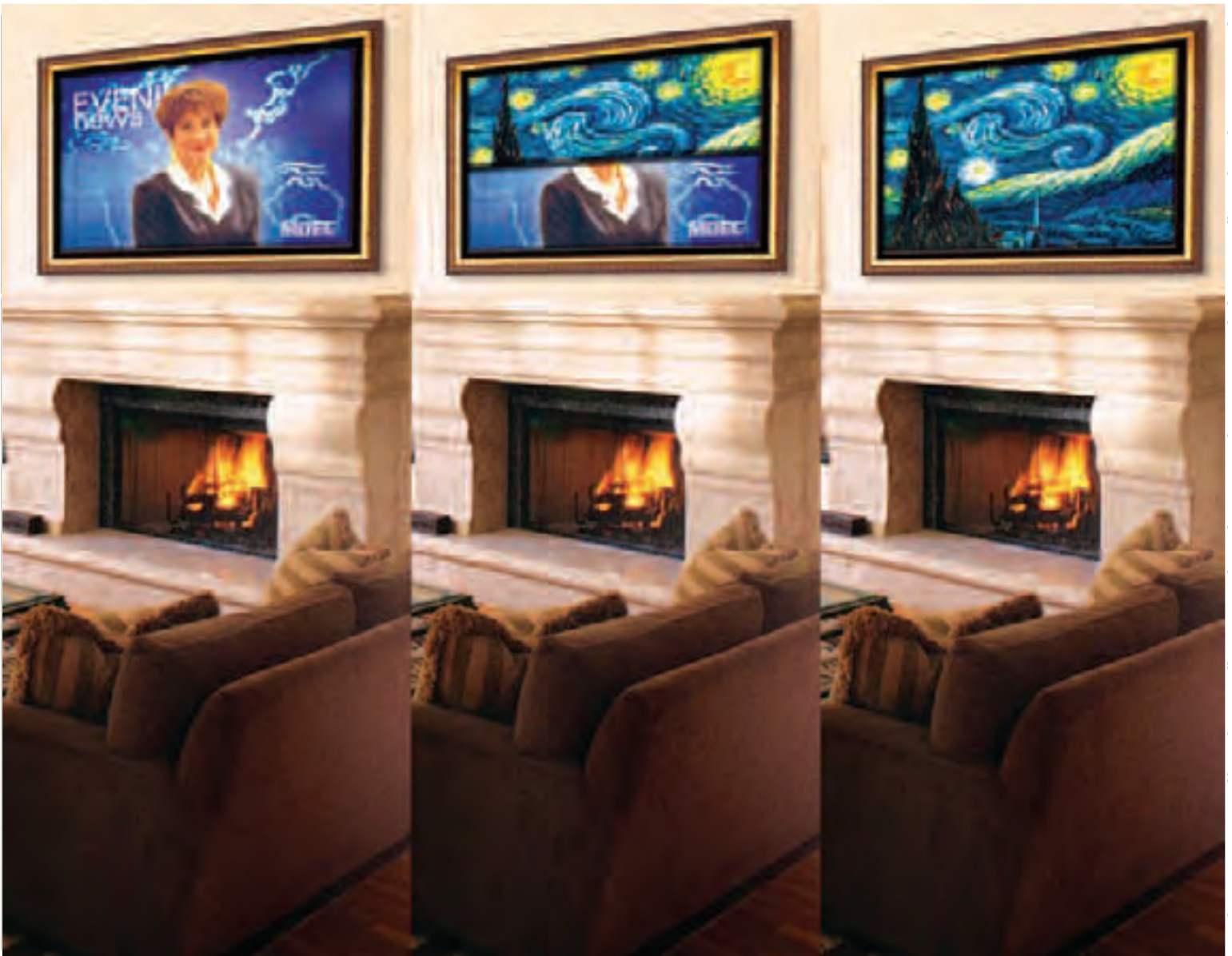
Above, the Hide and Chic™ Plasma TV mount is a great solution for your living room.

At Gleeson's Audio Video, you will find the finest home entertainment products in the world, which we have selected especially for their performance and value (Great performance doesn't have to cost a fortune.) In addition to offering the best equipment, our level of service and support is unmatched anywhere. We invite you to come in and let us prove it.